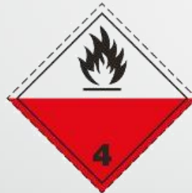
Spontaneously combustible material