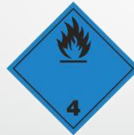
Release of flammable gases when in contact with water