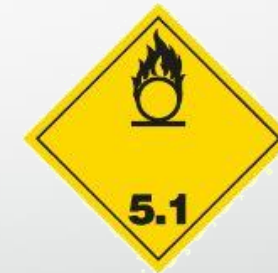
Oxidizer or organic peroxide