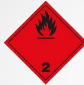
Inflammable liquid materials. Fire Danger